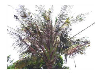
A coconut palm severely affected by the leaf beetle

Symptoms of attack and damage: The beetle attacks palms of all ages, but young palms are more susceptible than older ones, because the heart leaves of old palms are firmer and less suitable as breeding grounds for the beetle. Larvae of the beetle chew on large areas of the surface of leaflets still in the throat of the palm (the spear leaf), which causes the death of underlying tissues. Such leaflets show longitudinal white streaks. As the leaf emerges, the leaflets curl and turn brown, giving a characteristic scorched and ragged appearance. Photosynthesis is reduced to zero in affected leaflets. As the spear unfurls, the beetle moves on to other palms or the next emerging spear. The beetle does not attack leaves that emerge un-damaged. Severe attacks destroy unopened leaves, affect growth of the palm and reduce its productivity. In most cases, all the central leaves of affected palms appear brown and fruit shedding is common in such palms. Stunted palms with less compact hearts are more susceptible to leaf beetle attacks. Damage caused to millions of palms and substantial yield loss have been reported from countries infested by the beetle. A study commissioned by FAO showed that, if left uncontrolled, beetle infestations would cause in excess of US$ 1 billion damage in Vietnam alone.