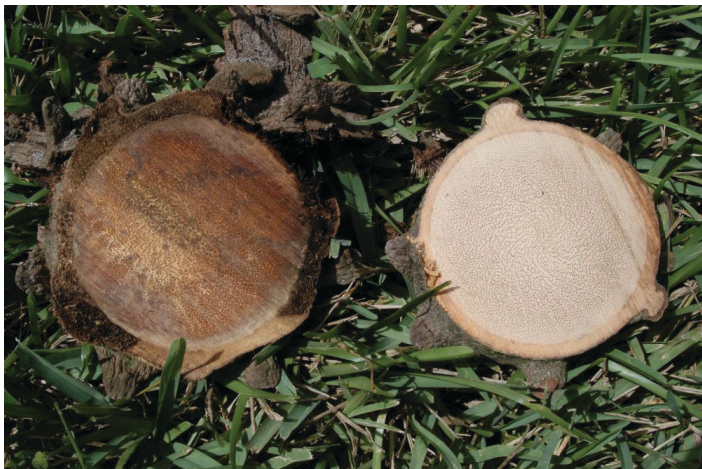
Figure 6. Comparison of pygmy date palm sections that are either healthy (right) or diseased (left) with Ganoderma zonatum .