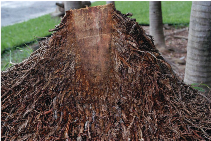
Figure 9. Longitudinal section through Phoenix roebelenii trunk and root system. The trunk is darkened due to infection with Ganoderma zonatum . The fungus is not rotting the roots but was isolated from the roots.

The fungus is spread primarily by the spores produced in the basidiocarp (conk). The spores become incorporated into the soil, germinate, and the hyphae (fungal threads) then grow over the palm roots. The fungus does not rot the palm roots, it simply uses the roots as a means of moving to the woody trunk tissue (Figure 9). Once a palm is infected with G. zonatum , the fungus will move with that palm to the location in which it is transplanted. It is also possible that soil associated with transplanted palms is infested with the fungus.