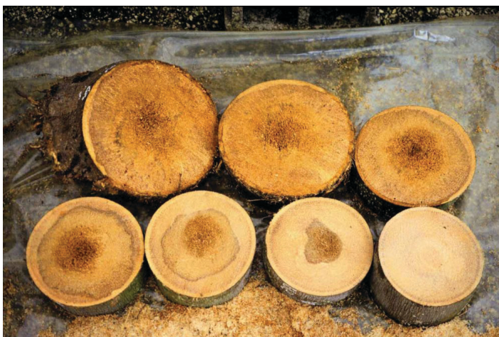
Figure 5. Cross-sections of lower trunk of Syagrus romanzoffiana infested with Ganoderma zonatum . Top-left section is bottom section (section 1) and remaining sections progress up the trunk. Note darkening of wood due to fungal degradation (rot).