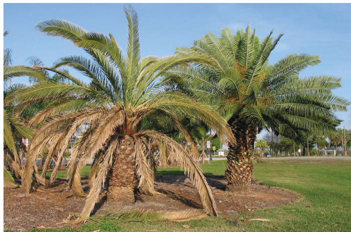
Figure 2. Phoenix canariensis (Canary Island date palm): Healthy palm (right) vs. beginning symptoms of Ganoderma butt rot (left), illustrating more dead lower leaves than would be normal (UF/IFAS 2015).

The basidiocarp or conk is the most easily identifiable structure associated with the fungus. The conk originates from fungal growth inside the palm trunk. Figure 3 illustrates different stages in the development of the conk. When the conk first starts to form on the side of a palm trunk or palm stump, it is a solid white mass that is relatively soft when touched. It will have an irregular to circular shape and is relatively flat on the trunk or stump.