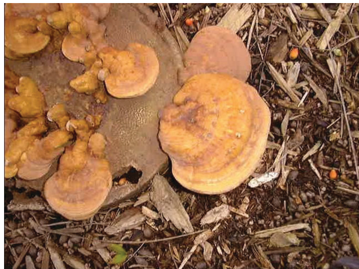
Figure 8. Spore release from mature conks (same stump as Figure 7) has resulted in reddish-brown appearance of conks and surrounding area.