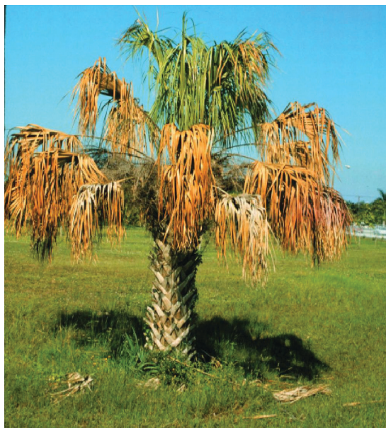
Figure 1. Sabal palmetto (sabal palm) with wilted and dessicated leaves due to Ganoderma zonatum infection.

Ganoderma zonatum is a white rot fungus that produces numerous enzymes that allow it to degrade (rot) woody tissue. The fungus first degrades lignin and then cellulose. As the fungus destroys the palm wood internally, the xylem (water-conducting tissue) will eventually be affected. Therefore, the primary symptom that may be observed is a wilting, mild to severe, of all leaves except the spear leaf (Figures 1 and 2). Other symptoms can best be described as a general decline—slower growth and off-color foliage—and more dead lower leaves than would be normal. However, these symptoms alone should not be used for diagnosis of Ganoderma butt rot, since other disorders or diseases may also cause these symptoms.