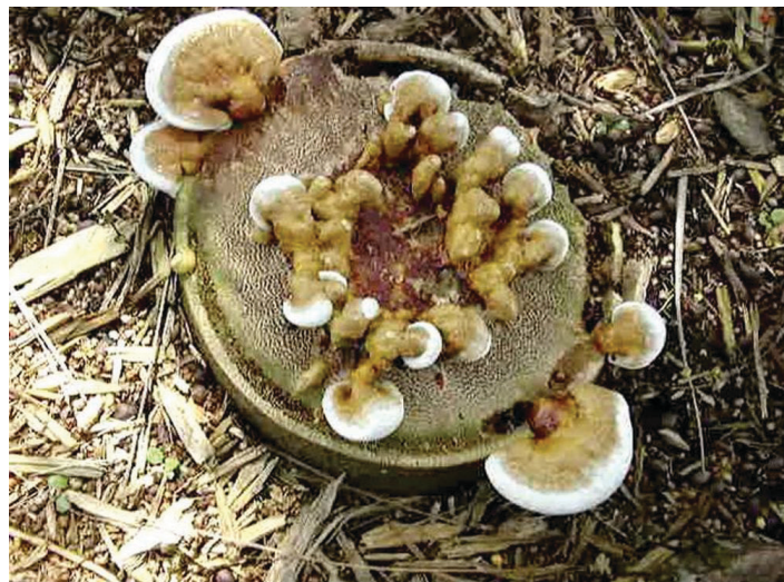
Figure 7. Cut palm stump with numerous basidiocarps (conks) of Ganoderma zonatum forming on it. The conks in the palm stump's center are crowding each other and thus are forming into shapes different from those on the outer edges of the stump.

Conks of G. zonatum can be up to 8 inches at their widest point and 2 inches thick. However, conks will take on the shape and size of the area in which they are growing (Figure 7). Microscopic basidiospores are produced in the “pores” present on the underside of the conk. When basidiospores are dropped en masse on a white surface, they will appear brownish-red in color (Figure 8). Objects immediately around a conk that has dropped its spores may appear to be covered with a rusty colored dust. One conk can produce 3 cups of spores.