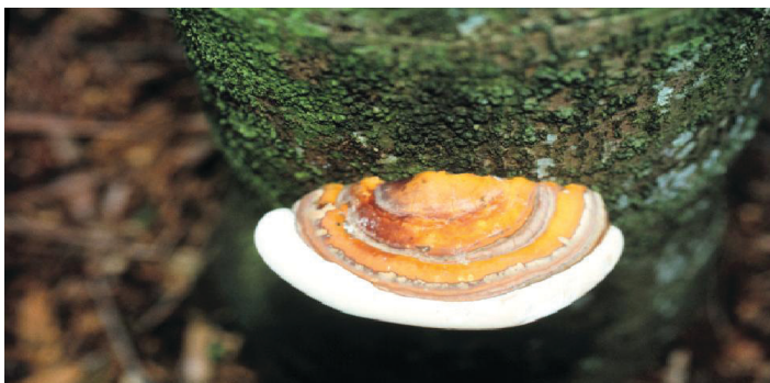
Figure 4. Basidiocarp (conk) of Ganoderma zonatum . Note glazed reddish-brown top surface and white undersurface. The “straight” side of the conk is directly attached to the trunk. There is no “stem” or “stalk” that attaches the conk to the trunk.