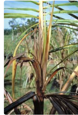
Photo 4. Basal stem rot of coconut seedling, caused by Phytophthora palmivora .