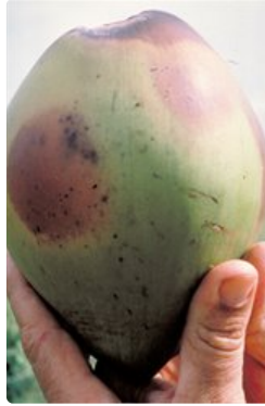
Photo 2. Nuts are also infected by coconut bud rot causing premature nutfall. In this case, Phytophthora hevae was isolated from the rot.