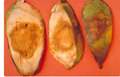
Photo 3. Slices from nuts (Photo 2) showing internal infections by Phytophthora hevae .