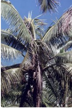
Photo 1. Bud rot of coconut showing the collapse of the spear and younger leaves due to infection by Phytophthora palmivora , while the older leaves appear relatively healthy at this time.