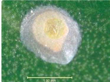
Photo 1. Female coconut scale, Aspidiotus destructor . Note that the body of the insect can be seen beneath the scale, hence the alternative name of "transparent scale".