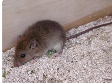
Photo 2. Polynesian rat, Rattus exulans .