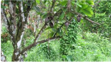
Photo 1. Cocoa pods eaten by rats.