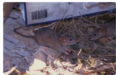
Photo 4. Brown rat, Rattus norvegicus .