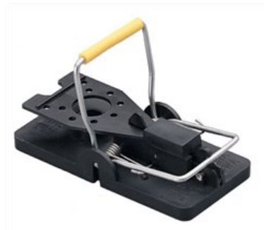
Photo 5. An example of a snap trap.