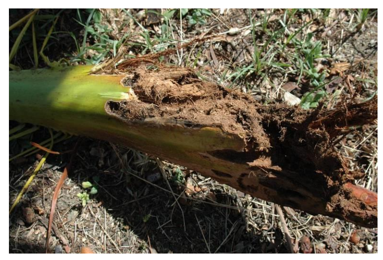
Figure 11. R. ferrugineus tunneling in frond. (Image courtesy of Amy Roda, USDA-APHIS).

tunneling occurring in the crown. This method will affect the appearance of the palm and access to the canopy may be difficult. Therefore, only highly suspect trees should be used and permission must be obtained from the property owner. Due to the long life cycle of the weevil, this type of inspection may detect the larval and pupal stages of the pest before adult weevils would be able to be detected in traps.