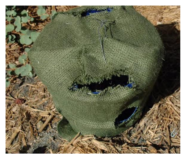
Figure 14. Homemade R. ferrugineus trap covered with burlap.