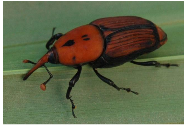
Figure 1. R. ferrugineus adult (Image courtesy of Amy Roda, USDA-APHIS).

*There is an array of color variations across the native and introduced range of Rhynchophorus ferrugineus , and the taxonomy has changed multiple times in the past. Recent molecular research suggests that Rhynchophorus ferrugineus may actually be a species complex composed of two or more cryptic species (Rugman-Jones et al., 2013). The suggested second species,