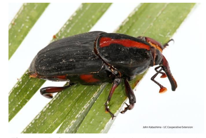
Figure 2. R. ferrugineus adult, red stripe color morph (Image courtesy of Center for Invasive Species Research).