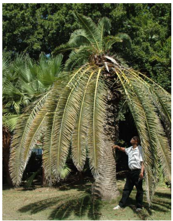
Figure 8. Deformed, offset growth of the top canopy of a palm infested with R. ferrugineus.

Damage caused by larval feeding can resemble symptoms caused by Fusarium fungi (e.g., wilting, drooping fronds) or rodents (e.g., holes at the base of fronds). It can be difficult to make the distinction as to the cause of the damage until life stages of R. ferrugineus can be found.