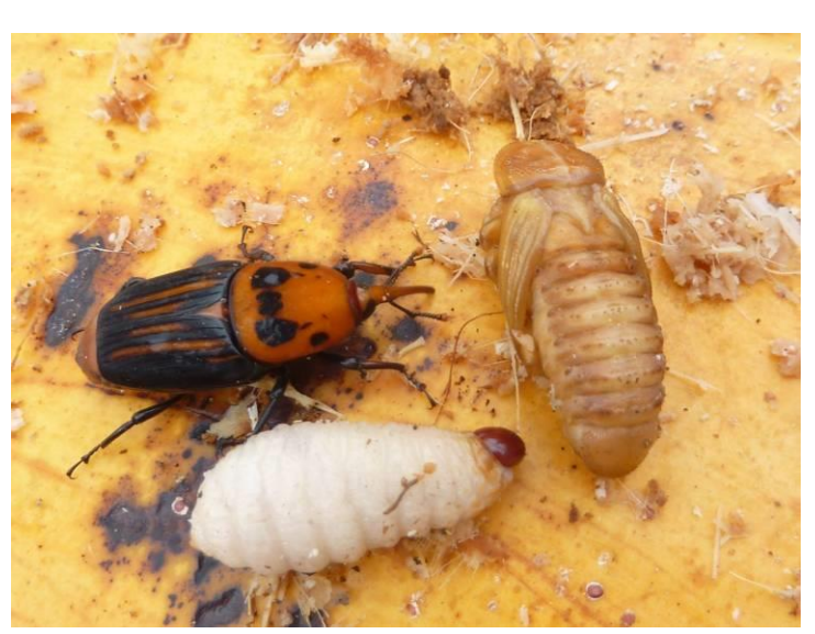
Figure 3. R. ferrugineus larva, pupa, and adult.

Antennae: "arising laterally from scrobe at base of rostrum; scrobe deep, broad and widely opened ventrally; scape elongate, longer than funicle and club combined or equal to one-half length of rostrum; funicle with 6 segments; antennal club large usually ferruginous or reddish-brown; broadly triangular with several setae dorsally and ventrally; inner side