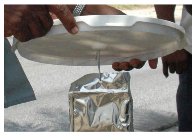
Figure 16. Lid of homemade bucket trap with hanging lure.

Completely cover the food bait with a liquid solution. The liquid is critical as the weevils are attracted to the humidity and it prevents the weevils from crawling out of the trap. A 50 to 50 solution of propylene glycol (low-toxicity anti-freeze such as RV & Marine Antifreeze) and water helps minimize evaporation and the chance of the trap drying and the beetles escaping. Enough water and propylene glycol should be added to completely cover the bait and in a quantity that will remain