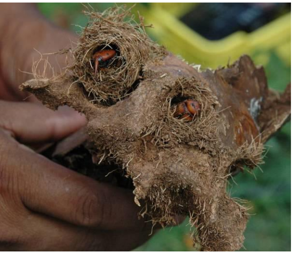
Figure 13. Frond with new adults.