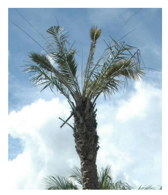
Figure 7. R. ferrugineus larval damage to fronds (Image courtesy of Amy Roda, USDA-APHIS).

The trunk of the host becomes weakened when attacked and can become a hazard due to the possibility of collapsing onto the surrounding area (EPPO, 2007).