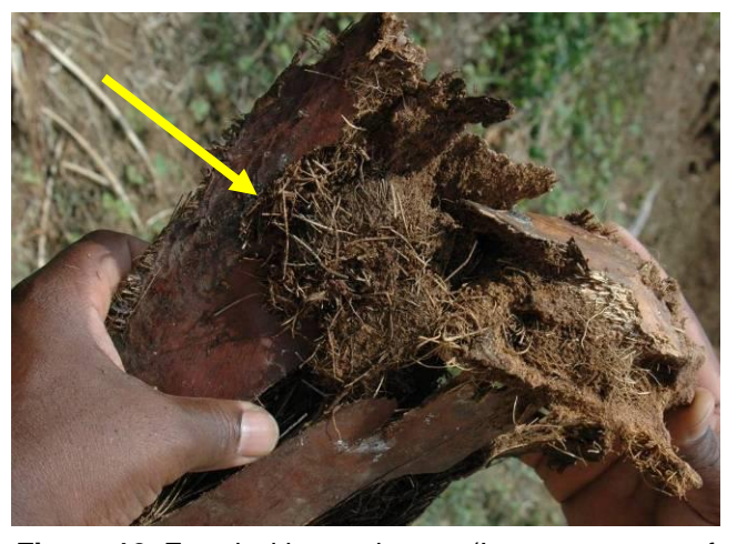
Figure 12. Frond with pupal case.