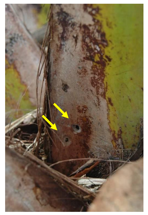
Figure 4. R. ferrugineus larval feeding holes at base of frond (Image courtesy of Amy Roda, USDA-APHIS).