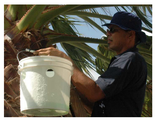
Figure 15. Homemade R. ferrugineus trap with entrance holes.