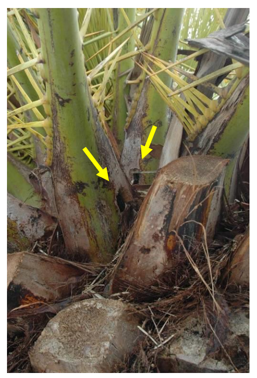
Figure 5. Adult R. ferrugineus emergence holes (Image courtesy of Amy Roda, USDA-APHIS).

2010b). Abbas et al. (2006) found that marked and released weevils could migrate up to 7 km (4.3 miles) in 3 to 5 days. Adults are usually attracted to damaged or dying palms although undamaged palms can also be attacked (Murphy and Briscoe, 1999).