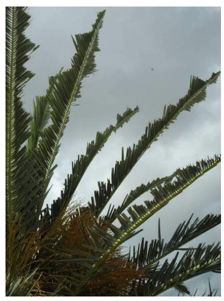
Figure 6 . Extreme R. ferrugineus larval damage to palm frond.